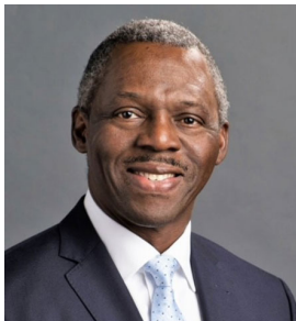
Chair of the Board Hockey Canada 2023