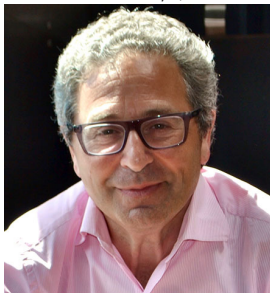
Chair of the Board Hockey Canada 2025