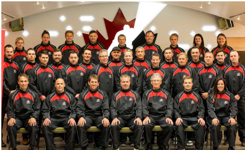
2017 Skills Coach Certification Class