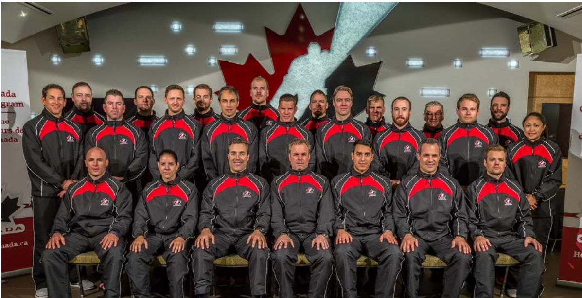
Inaugural Skills Coach Certification Class