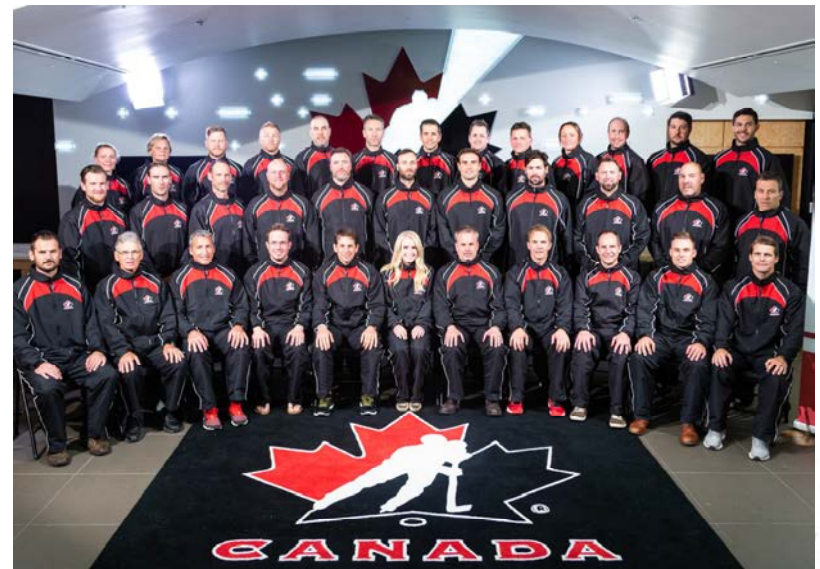
2018 Skills Coach Certification Class