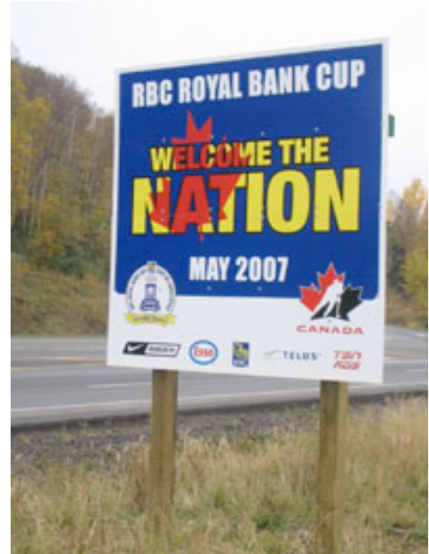
Highway Billboard on Highway 16 East Near Yellowhead Bridge Promotes National Championship